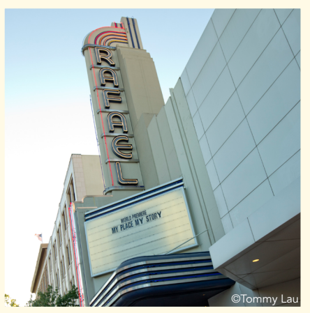
The Smith Rafael Film Center, home of the Mill Valley Film Festival

Each year the festival welcomes more than 200 filmmakers, representing more than 50 countries. Screening sections include world cinema, US cinema, documentaries, family films, and shorts programs. Annual festival initiatives include Active Cinema, a forum for films that aim to engage audiences and transform ideas into action; Mind the Gap, a platform for inclusion and equity; and ¡Viva el Cine!, a showcase of Latin American and Spanish-language films.. Festival guests also enjoy an exciting selection of Tributes, Spotlights and Galas throughout the program.