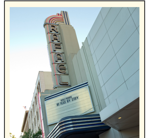
The Smith Rafael Film Center, home of the Mill Valley Film Festival

Each year the festival welcomes more than 200 filmmakers, representing more than 50 countries. Screening sections include world cinema, US cinema, documentaries, family films, and shorts programs. Annual festival initiatives include Active Cinema, a forum for films that aim to engage audiences and transform ideas into action; Mind the Gap, a platform for inclusion and equity; and ¡Viva el Cine!, a showcase of Latin American and Spanish-language films.. Festival guests also enjoy an exciting selection of Tributes, Spotlights and Galas throughout the program.