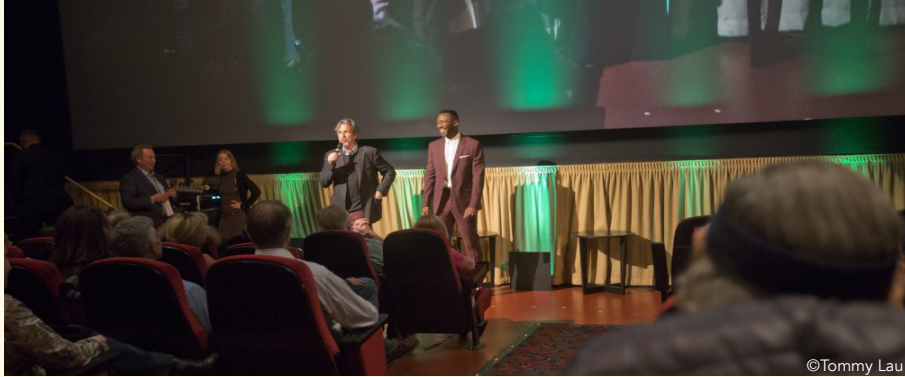
An opening night screening at the Mill Valley Film Festival.