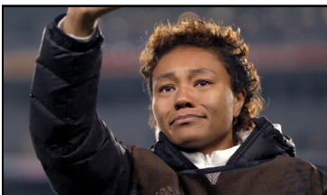
Maybe it's Just the Rain Filmmaker: Reina Bonta