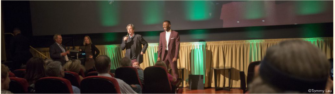
An opening night screening at the Mill Valley Film Festival.