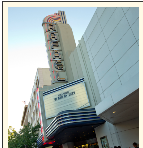
The Smith Rafael Film Center, home of the Mill Valley Film Festival

build an inclusive community around the art of documentary filmmaking. DocLands aims to illuminate filmmakers' diverse perspectives and ignite a passion for exploring real-world issues by showcasing compelling stories and the thought-provoking insights behind them. Join us as we embark on a journey to discover, connect, and celebrate the power of documentary cinema.